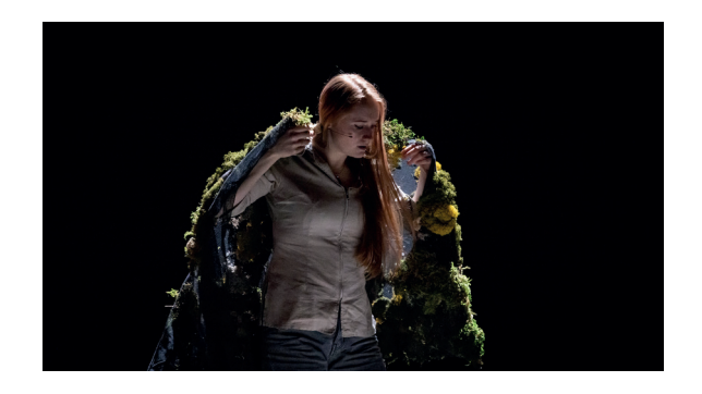
Like flesh Opéra de Lille (France)